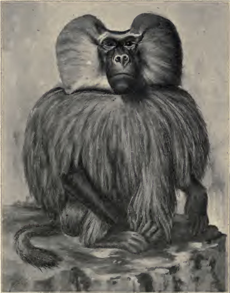
FIG. LXXXVIII. PAPIO HAMADRYAS. THE TARTARIN.

Hamadryas ægyptiaca Gray, Cat. Monkeys, Lemurs & Fruit-eating Bats Brit. Mus., 1870, p. 34.